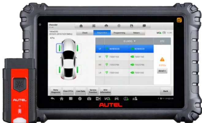
■ MAXIVCI VCI200