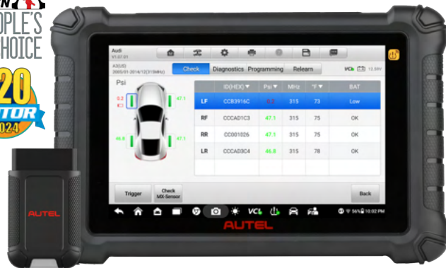
■ MAXIVCI V150