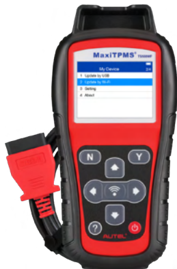
TPMS SERVICE & DIAGNOSTICS